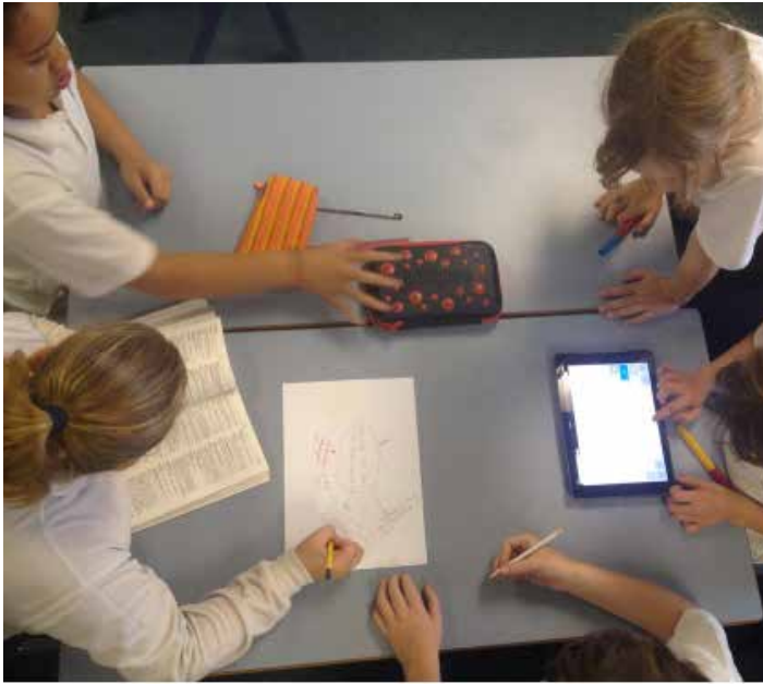
From StPetersPS @SPPSnews - Nov 2 3/4T students working together in a mini #SOLE activity answering the question 'What is the point of punctuation?'

Our classes have been busy bees this past two weeks doing persuasive writing, practising fun numeracy skills and project based learning. More fun classroom lessons will be taking place over next couple of weeks and all the classrooms are buzzing with excitement.