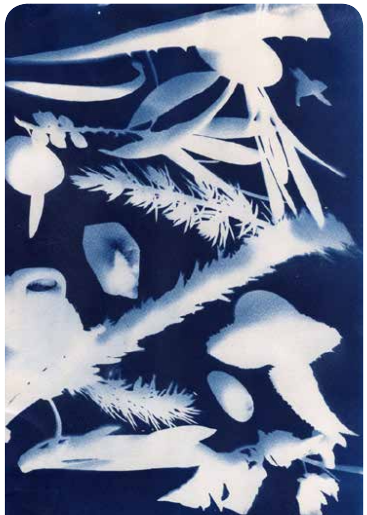
Inspired by Life by St Peters Public School (INSPIRE!)

Exhibitions on display from 19 September to 28 November 2019