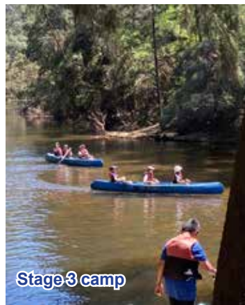
Stage 3 camp