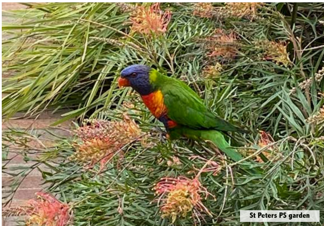
St Peters PS garden