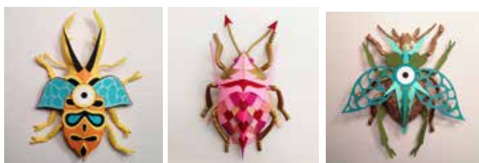
Artworks by Ashley Gierke

Come along and enjoy our fun art classes in term 1, 2020. Create a colourful cactus clay sculpture, learn how to mix monochromatic colours and paint an artwork inspired by the Blue Period of Picasso. Design and construct an insect artwork inspired by the artwork of Ashley Gierke and create a colourful mixed-medium artwork of an animal inspired by Panamanian Molas artworks. Finally have fun learning how to draw a realistic drawing of a bee using different drawing techniques.