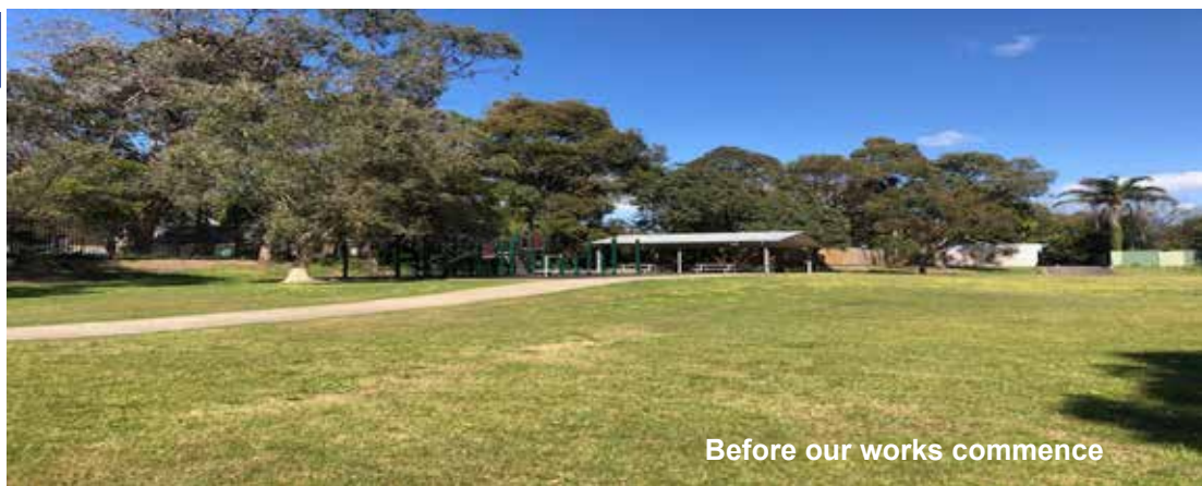
Before our works commence