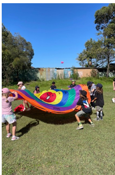
Fun Day 2021