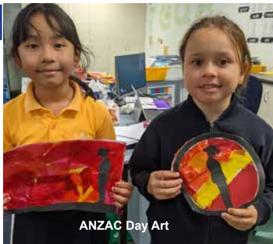
ANZAC Day Art